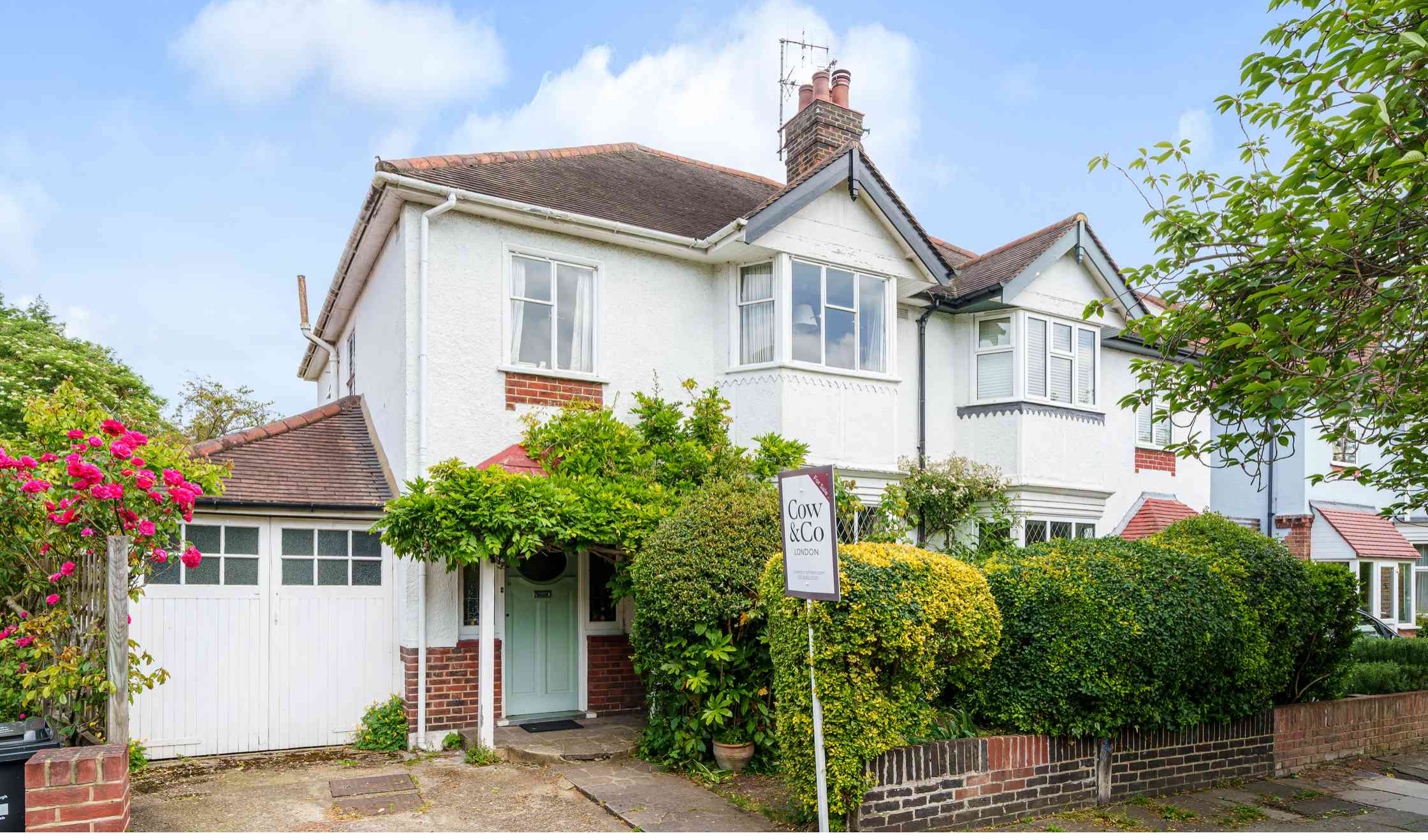
Staveley Road, London, W4 3HU