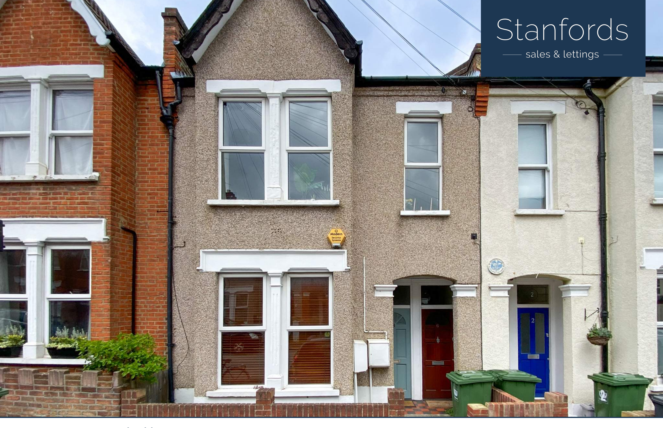
£1,800 pcm Not Applicable

Shipman Road Forest Hill 2 bedroom ground floor maisonette