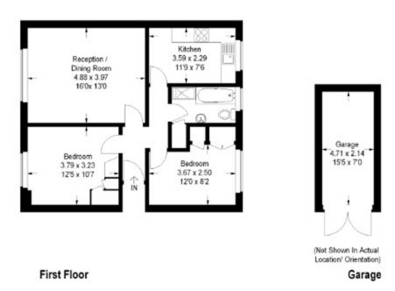
Illustration for identification purposes only, measurements are approximate, not to scale. FloorplansUsketch.com © 2014 (ID92501)