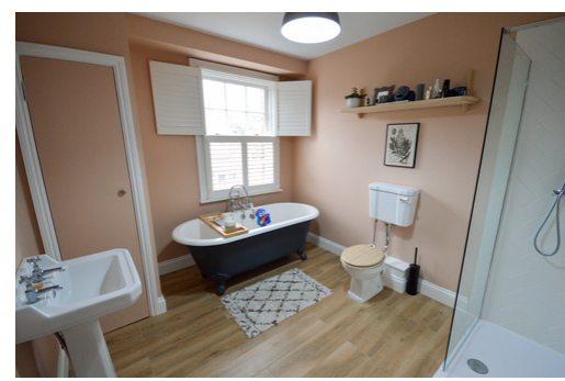
Be prepared to be impressed!

The owners of this Victorian Four bedroom family home have tastefully extended and renovated this property to a high standard. You'll find High Ceilings, Sash windows, cast iron fireplaces in addition to a modern re-fitted kitchen, four piece bathroom suite and a modern ensuite to the master bedroom. The perfect mix of modern and period throughout.