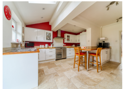
Dale Park Road, London, SE19