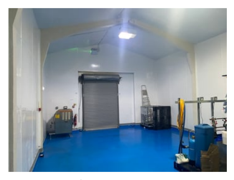
Production room / Area off

28' 8" x 53' 6" (8.74m x 16.31m) with electric roller shutter door, full height to eaves at front.