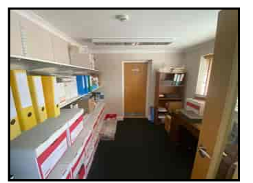
Units 1 and 2 Station Road, Tregaron, Ceredigion. SY25 6HX.