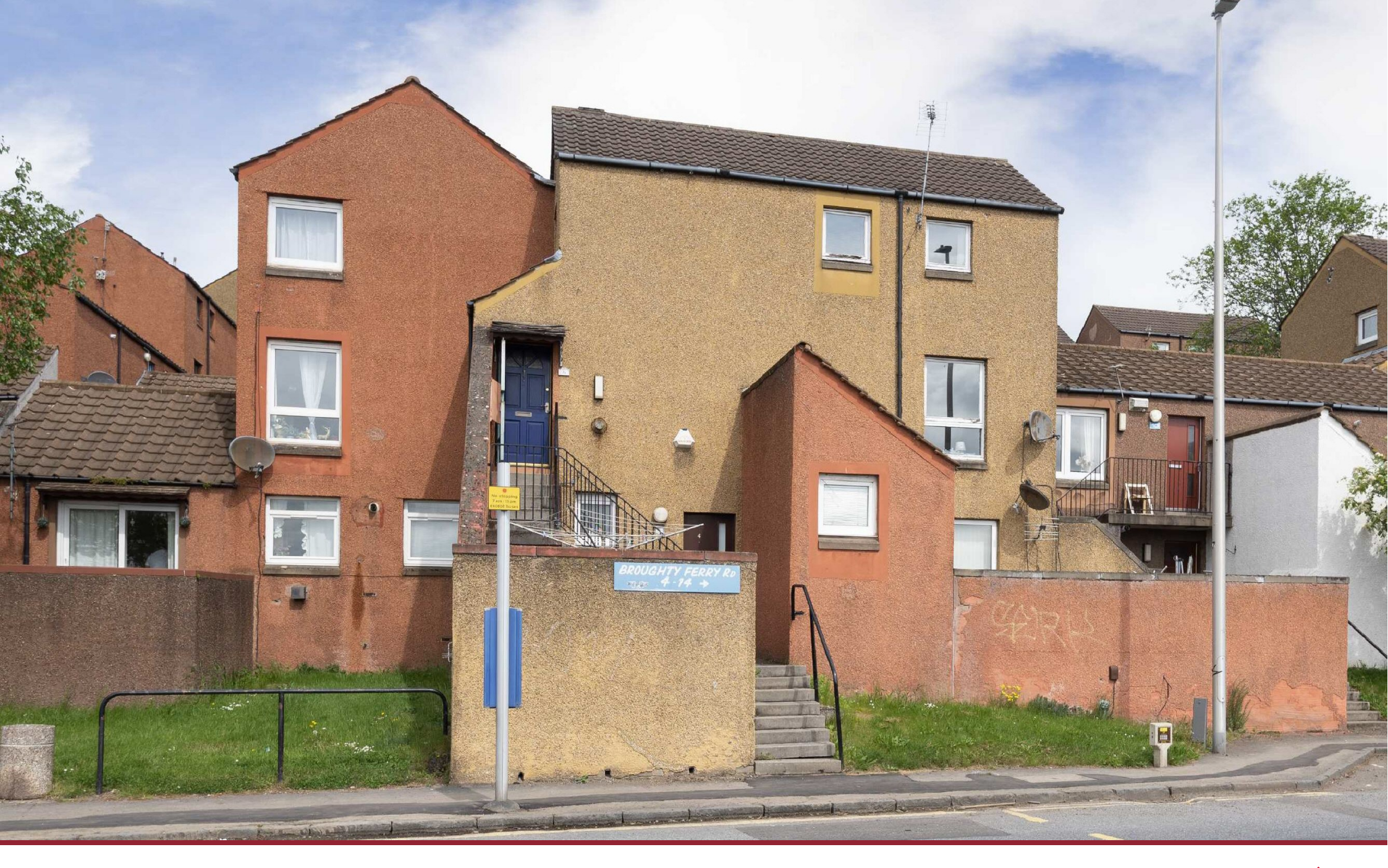
6 Broughty Ferry Road Dundee DD4 6BD