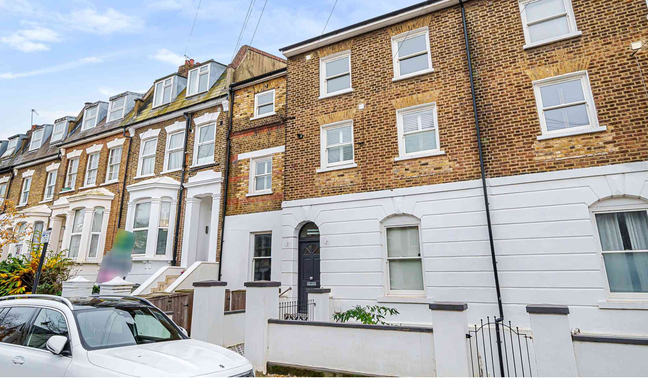
Mill Hill Road, London, W3 8JE