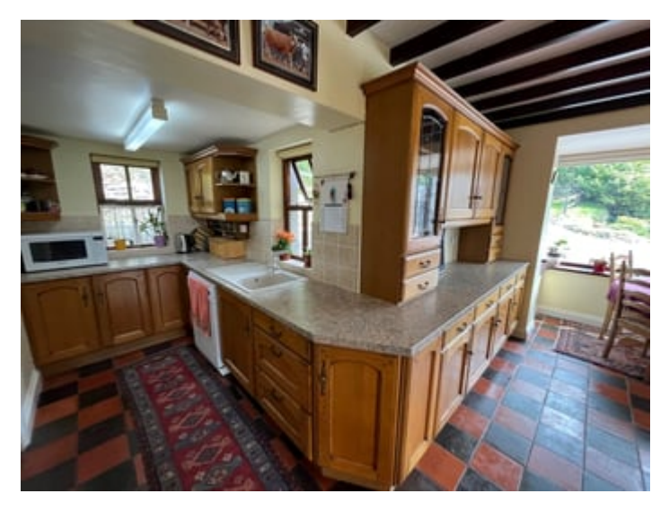
to front patio area, radiator, multiple sockets, beams to ceiling.

19' 9" x 13' 7" (6.02m x 4.14m) a good-sized family Living Room with inglenook stone fireplace and surround, multi fuel burner with Oak mantle, slate hearth, window and glass doors