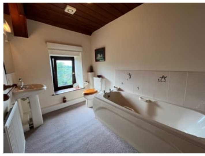
9' 1" x 6' 1" (2.77m x 1.85m) with panelled bath, w.c. single wash hand basin, window to front, radiator. Electric towel rail.