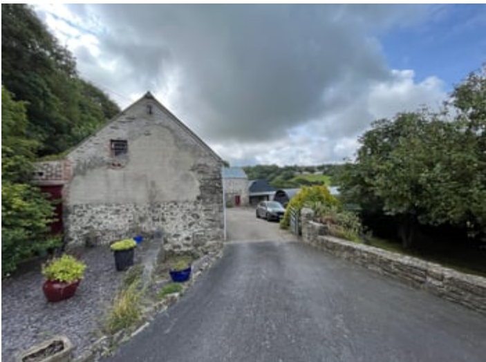
a range of traditional stone barns and outbuildings mixed with more modern Dutch Barn and Steel framed buildings.

The yard continues through the buildings to a lower area providing access to the adjoining fields at the bottom end of the farm.