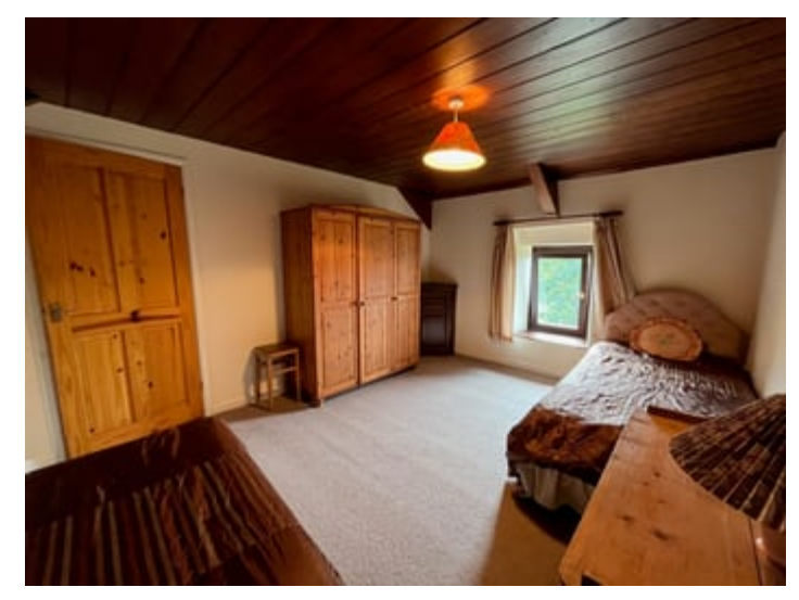
13' 8" x 10' 8" (4.17m x 3.25m) a double bedroom, window to front, radiator, multiple sockets. Tongue and groove panelling to ceiling.