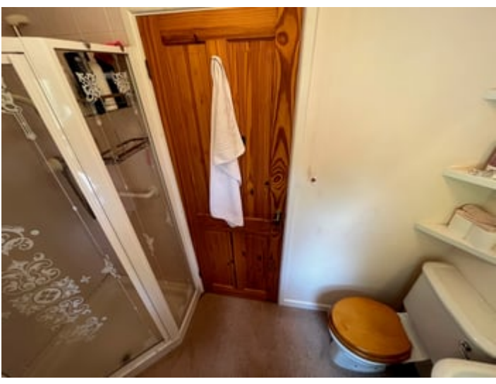
4' 8" x 8' 9" (1.42m x 2.67m) enclosed tiled shower unit, w.c. single wash hand basin, radiator. Side window.