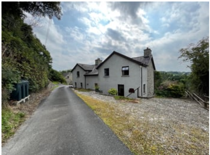
The property is approached via a private tarmacadamed driveway with mature hedgerows to both sides into a large forecourt space with ample room for parking and providing access to the woodland area and also the traditional farmyard