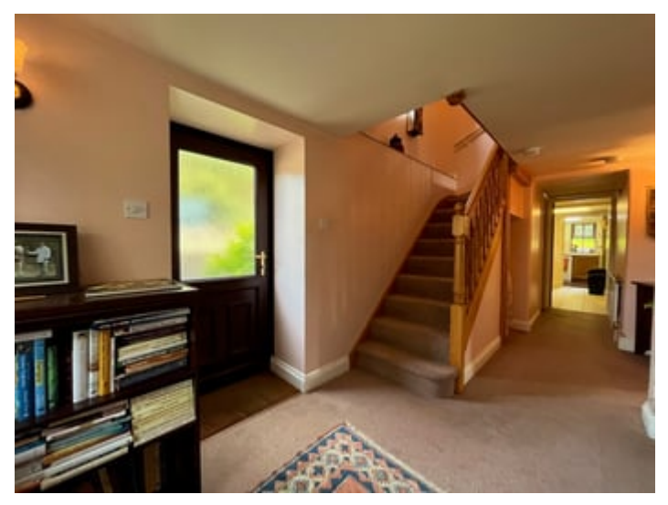
With radiator. Stairs to first floor, rear pedestrian door, side window.