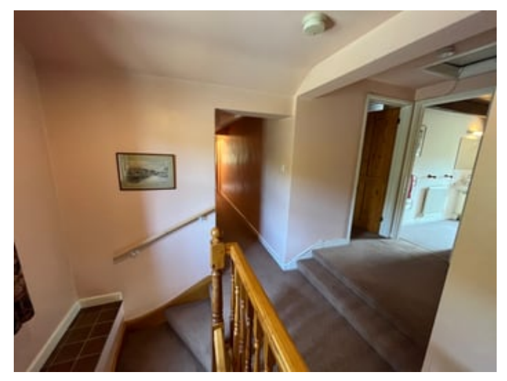
With window to half landing, side seating area.