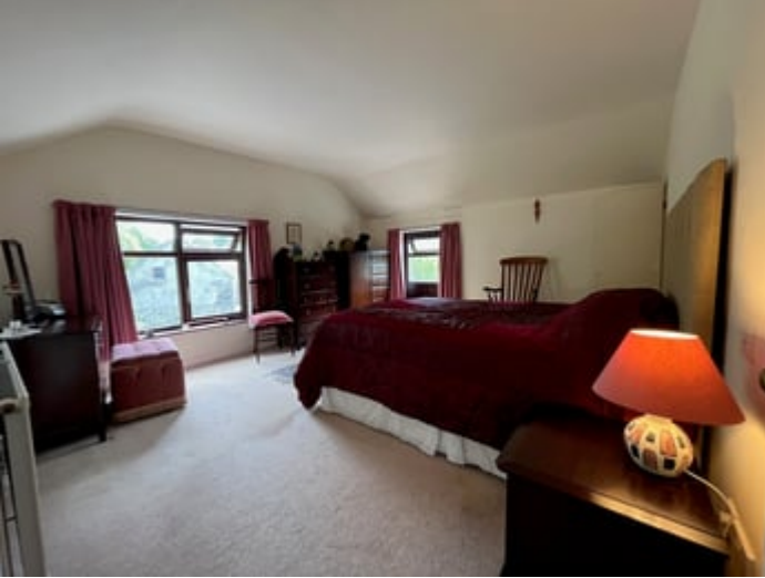
14' 1" x 13' 1" (4.29m x 3.99m) a double bedroom, dual aspect windows to front and side, radiator, multiple sockets, 2 fitted cupboards.