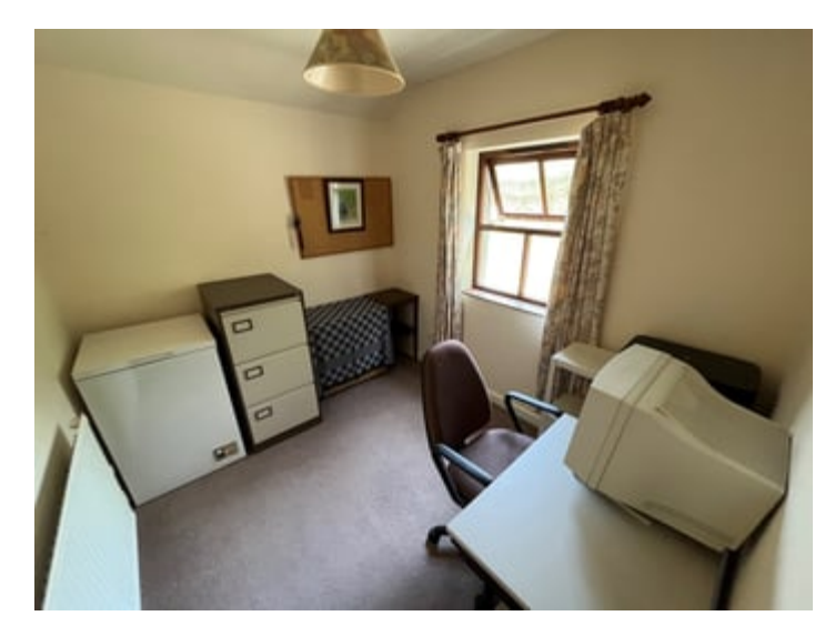
Front Bedroom 2

8' 8" x 7' 4" (2.64m x 2.24m) with window to rear, radiator, multiple sockets, airing cupboard with radiator.