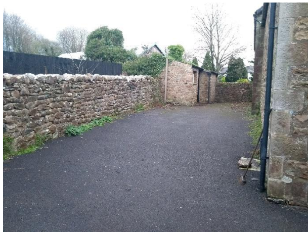
Rear Yard Area