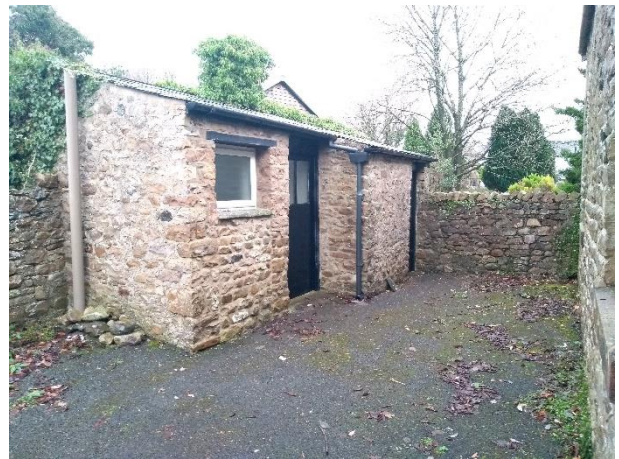
Outside WC & Store