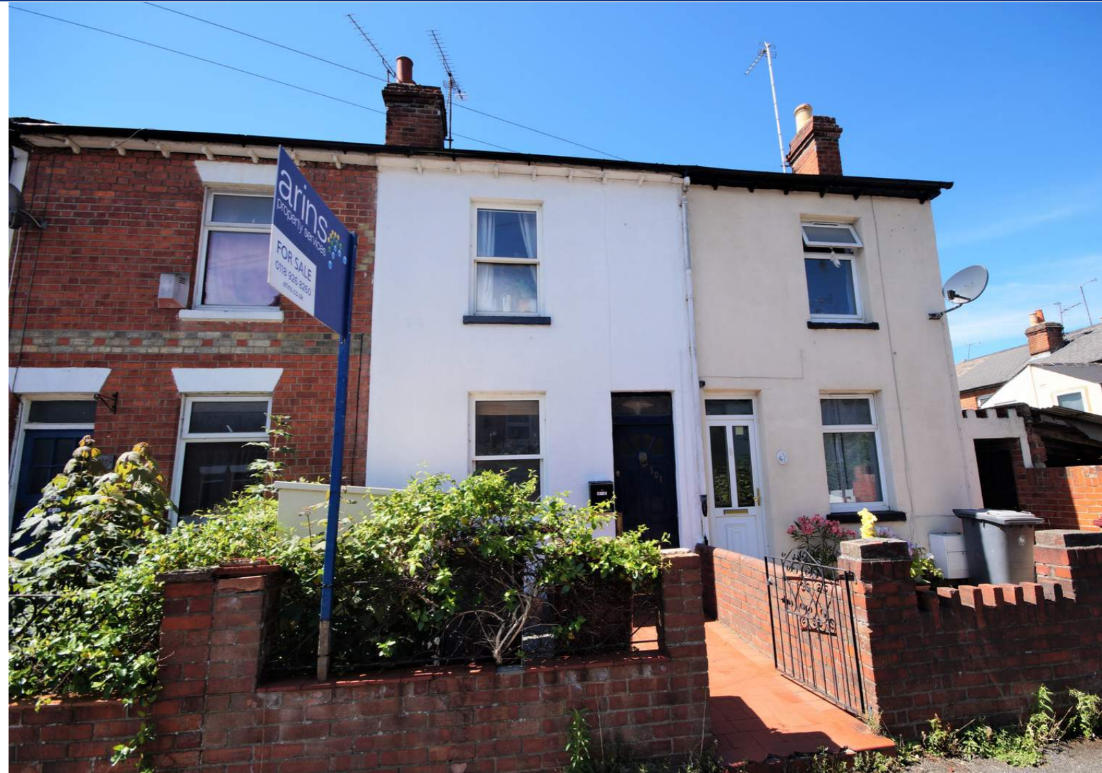
Cumberland Road, Reading, Berkshire. RG1 3JT.