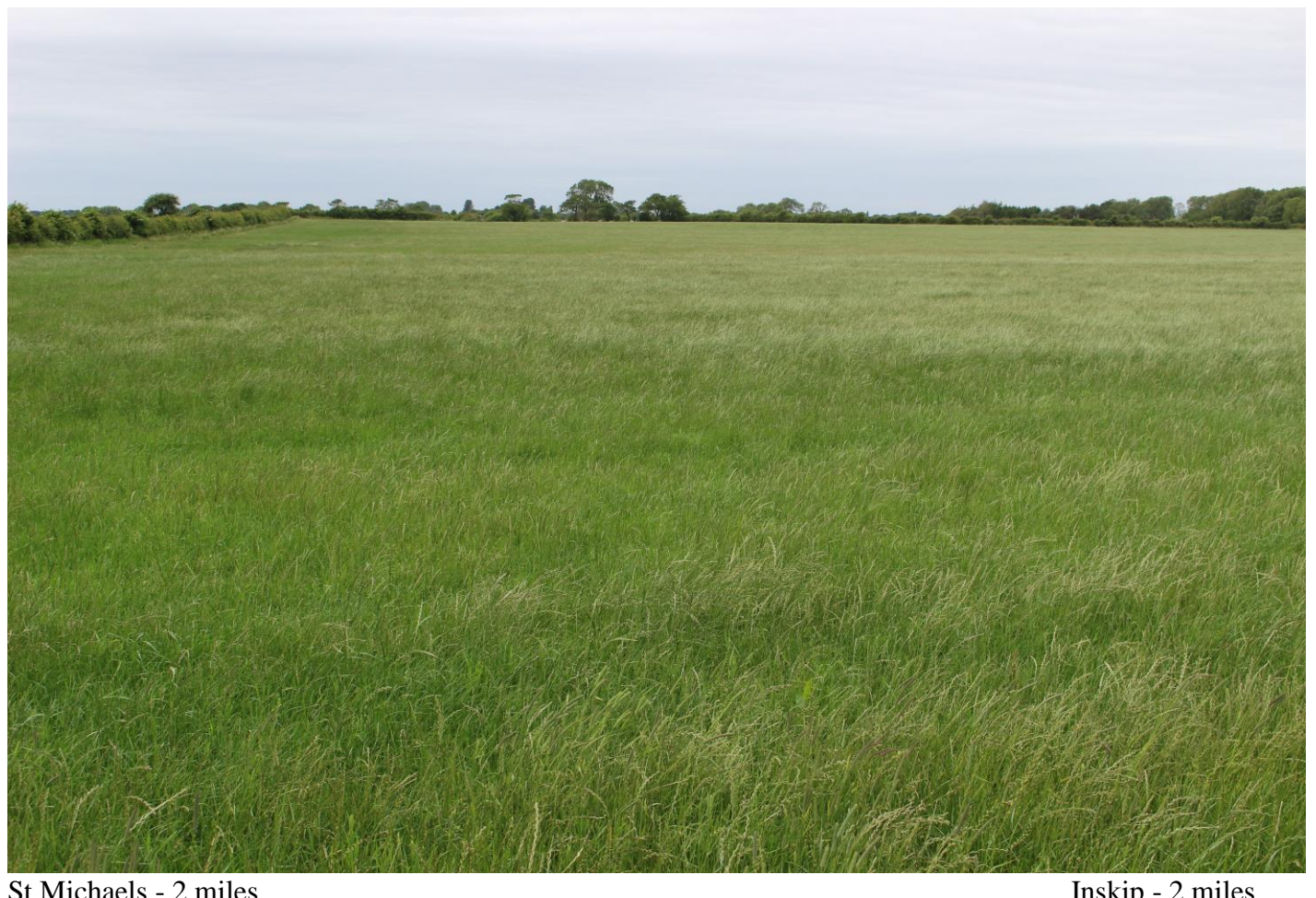
St Michaels - 2 miles Inskip - 2 miles