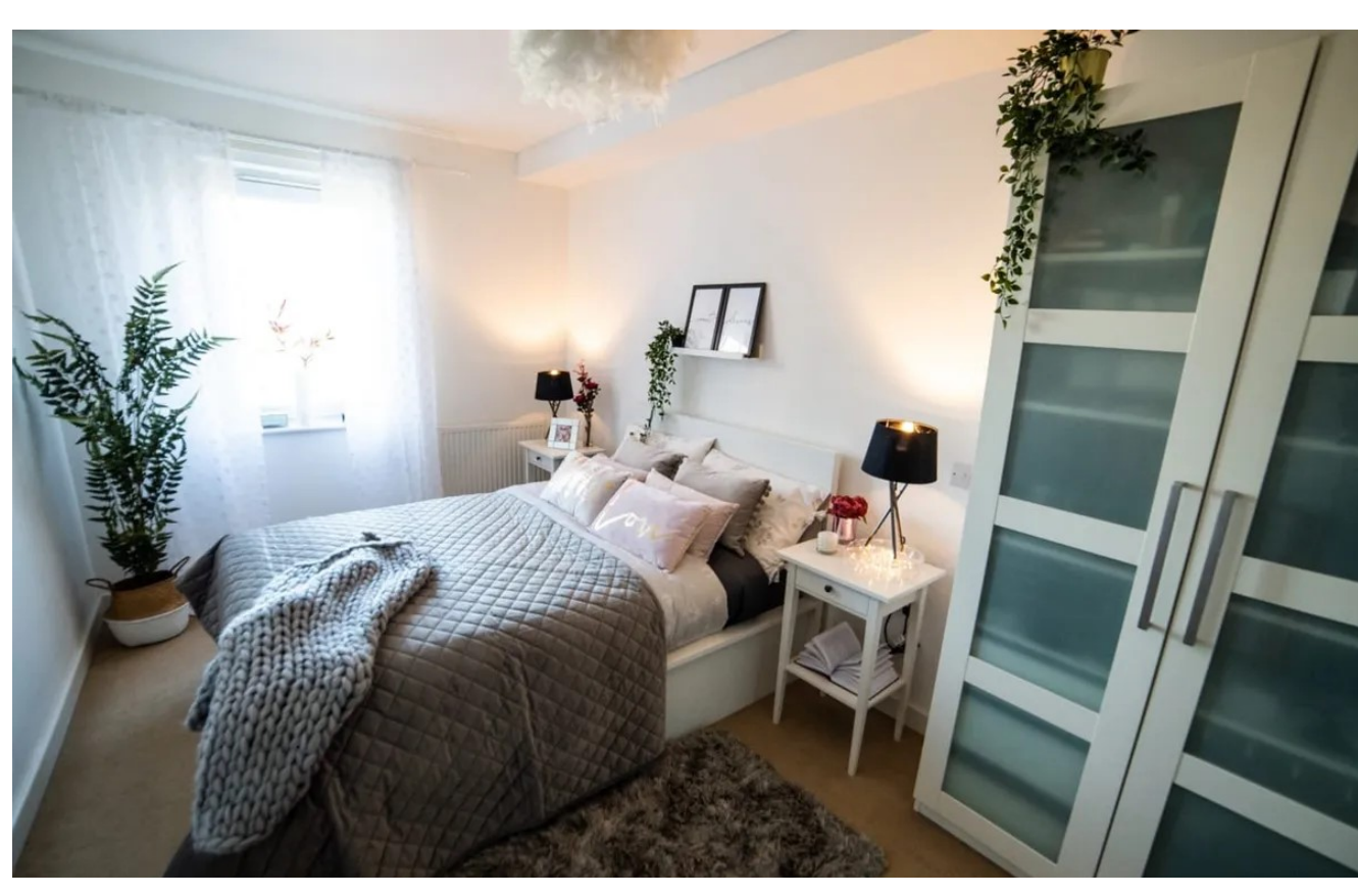
Flat 6, 117 Springate House, Walton Road. E12 5BF.