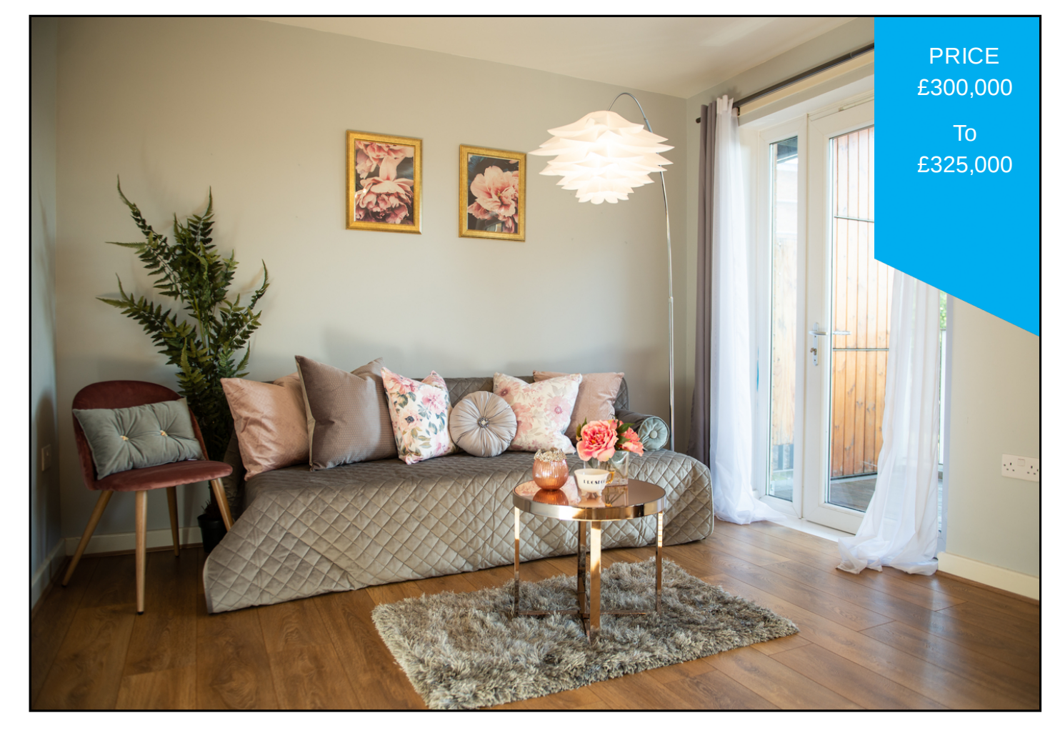
Flat 6, 117 Springate House, Walton Road. E12 5BF.

We are based just two doors down from East Ham Station.