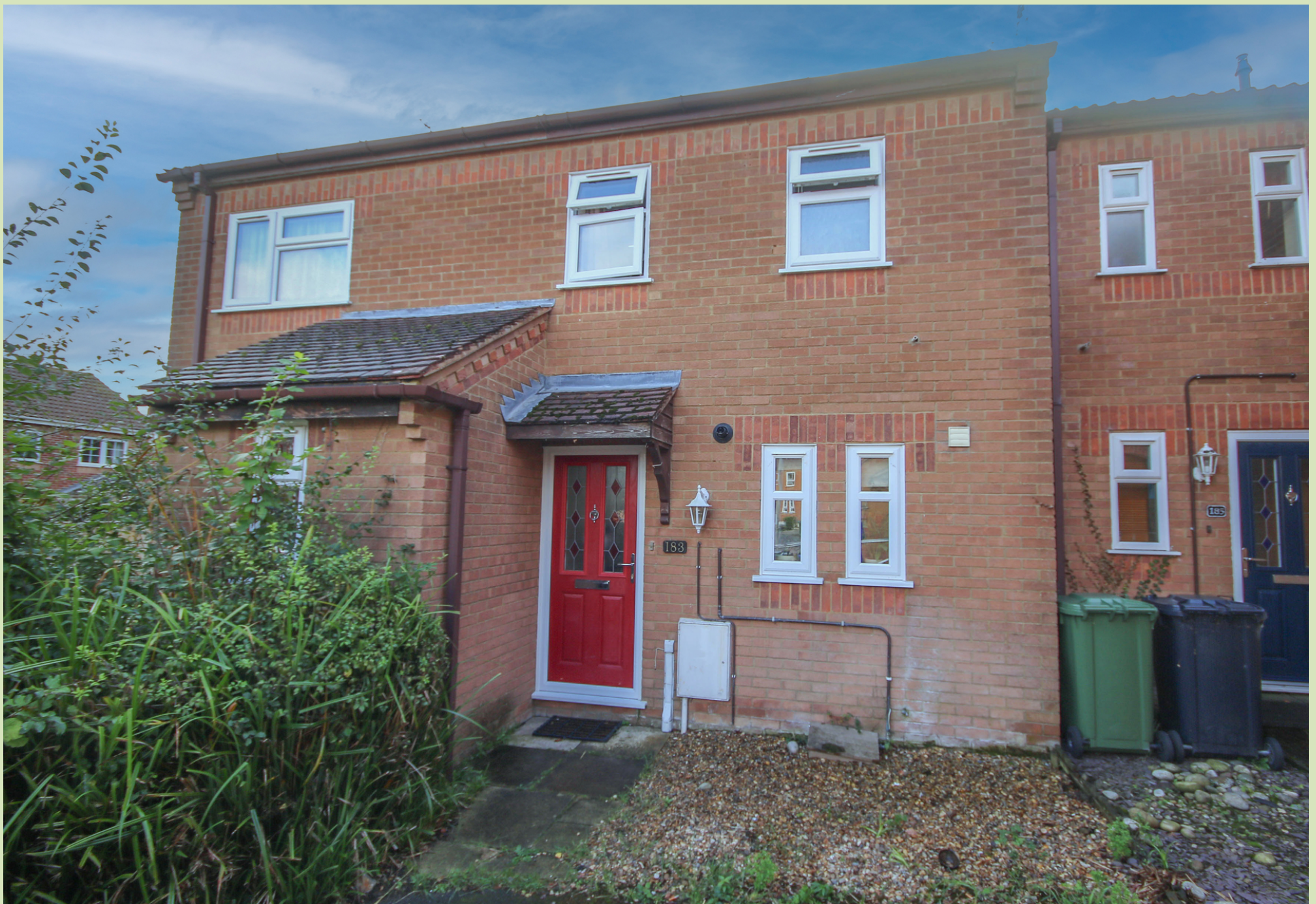
183 Elvington, King's Lynn Guide Price £179,950