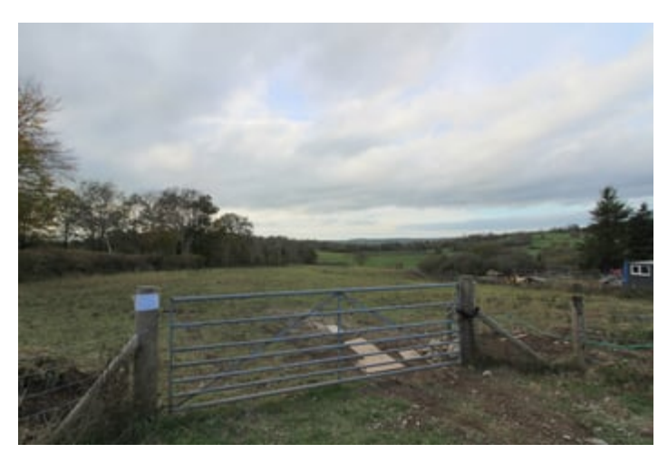
Services Mains water connected, electricity available nearby.