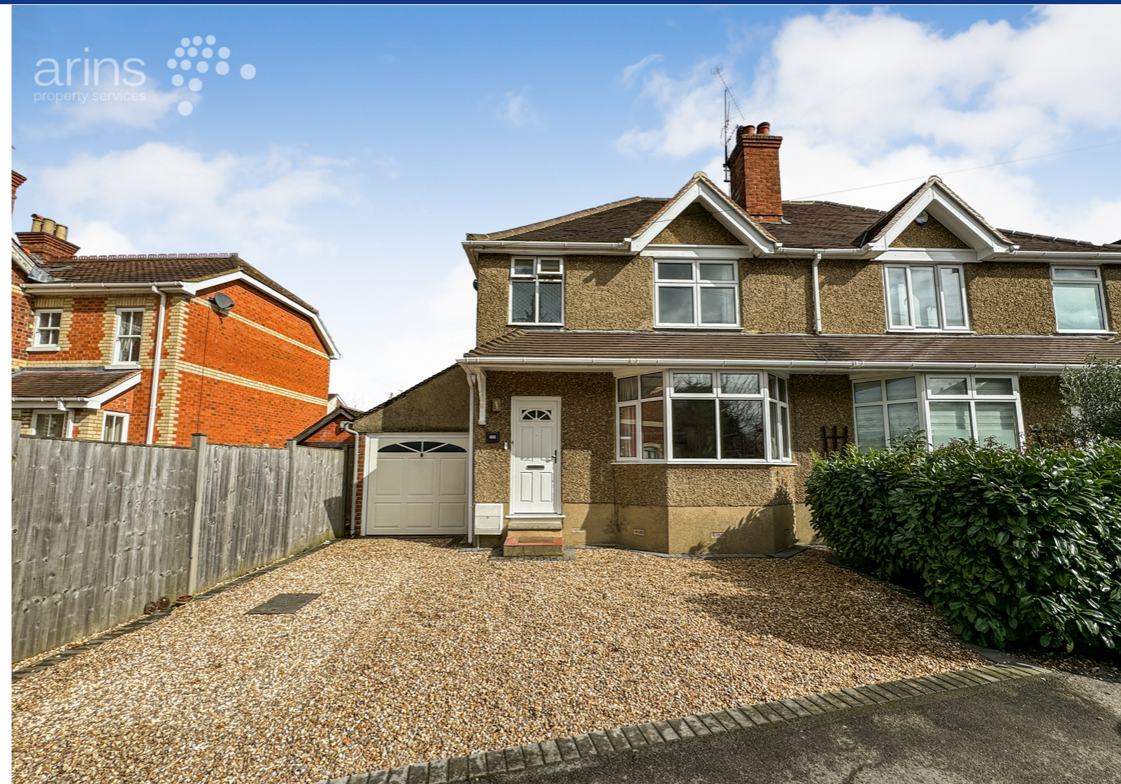
121 St Peters Road, Reading, Berkshire. RG6 1PG